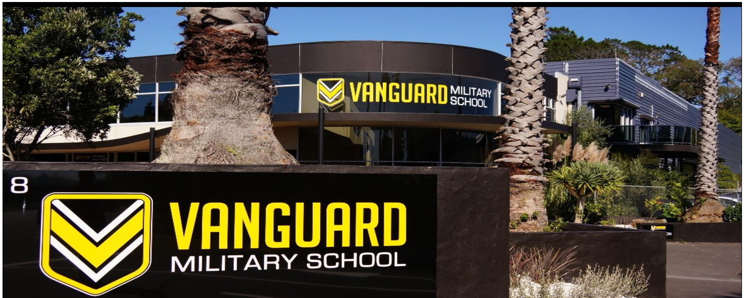
VANGUARD MILITARY SCHOOL EFFORT BRINGS REWARD