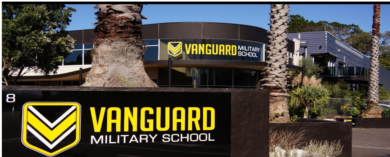
VANGUARD MILITARY SCHOOL EFFORT BRINGS REWARD