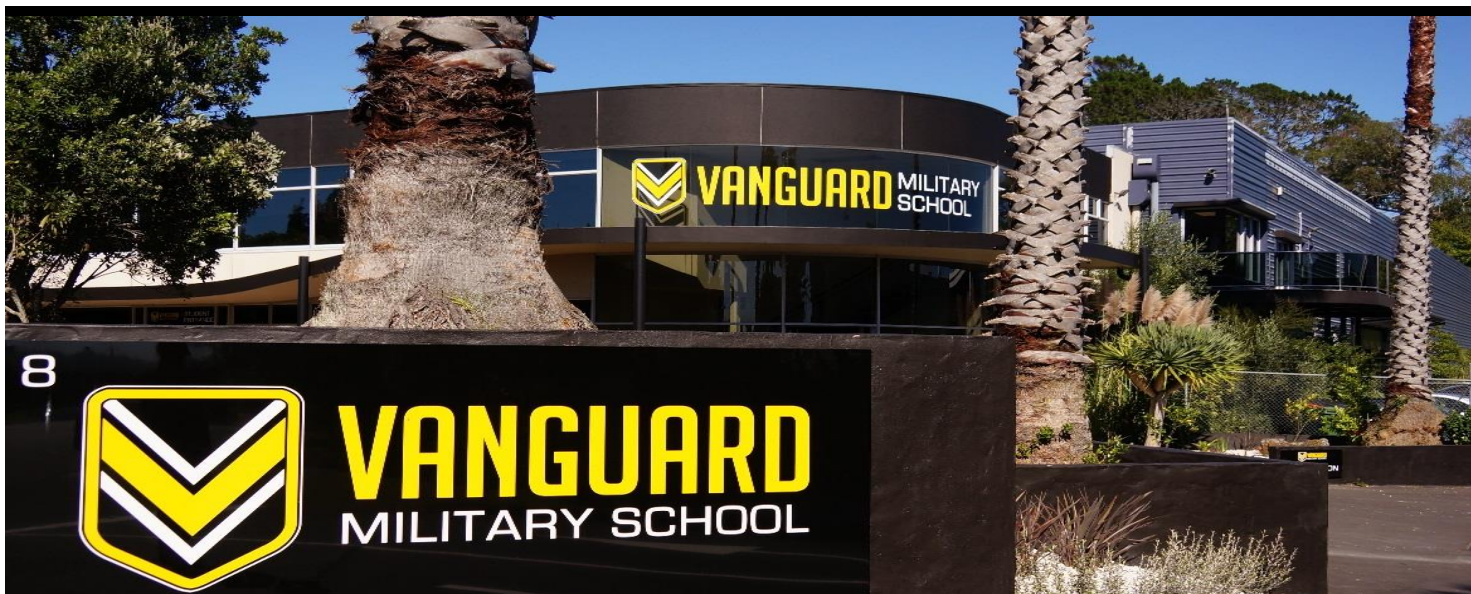
VANGUARD MILITARY SCHOOL EFFORT BRINGS REWARD