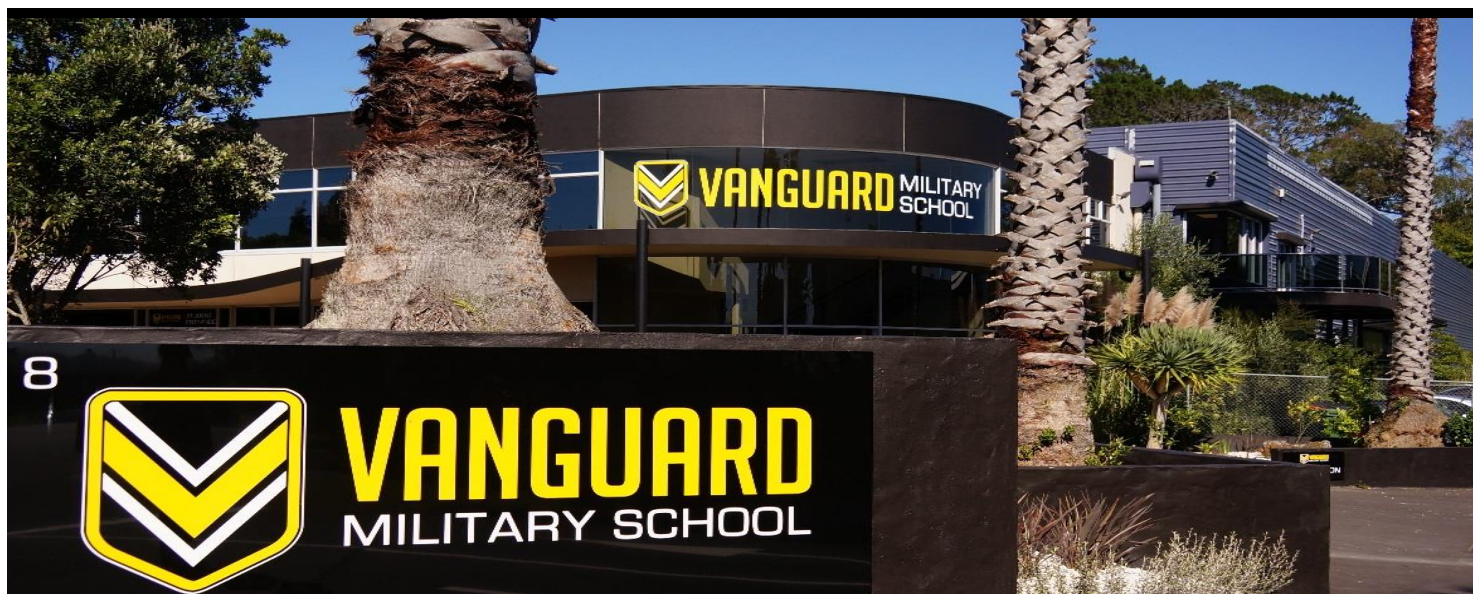
VANGUARD MILITARY SCHOOL EFFORT BRINGS REWARD